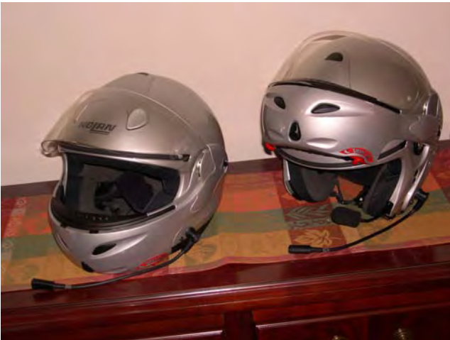
NOLAN-N100E_Sm.&Md. With Headsets