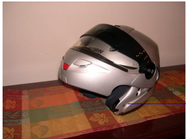
NOLAN-N102_Sm. No Headset