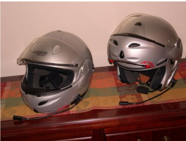
NOLAN-N100E_Sm.&Md. With Headsets