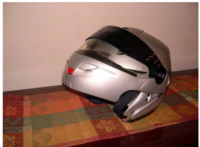
NOLAN-N102_Sm. No Headset