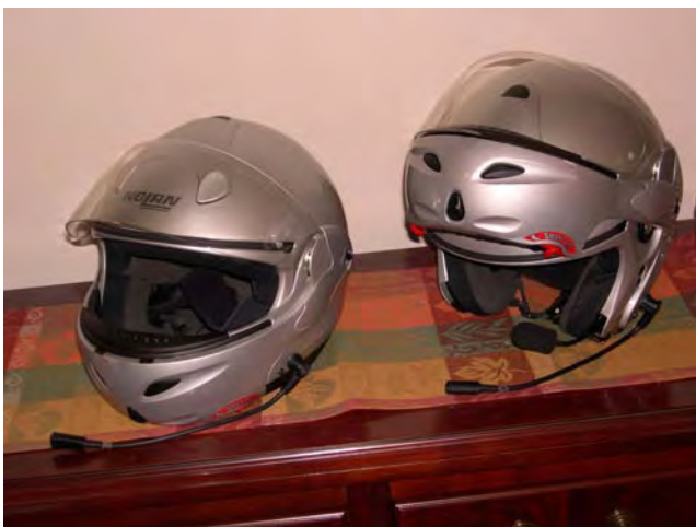
NOLAN-N100E_Sm.&Md. With headsets