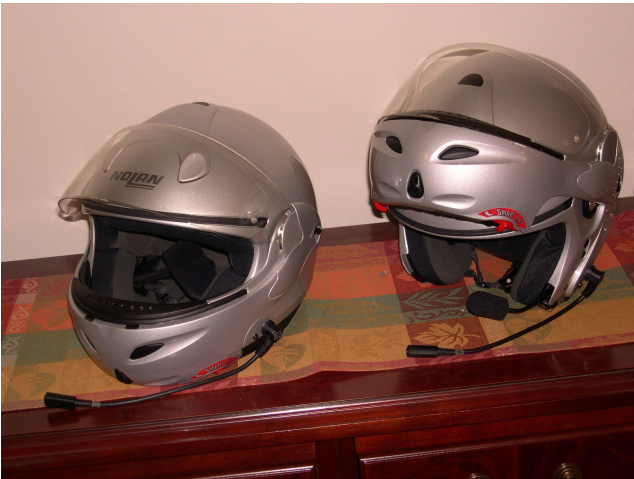
NOLAN-N100E_Sm.&Md. With Headsets