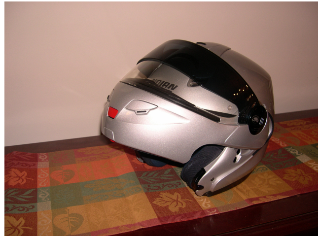
NOLAN-N102_Sm. No Headset