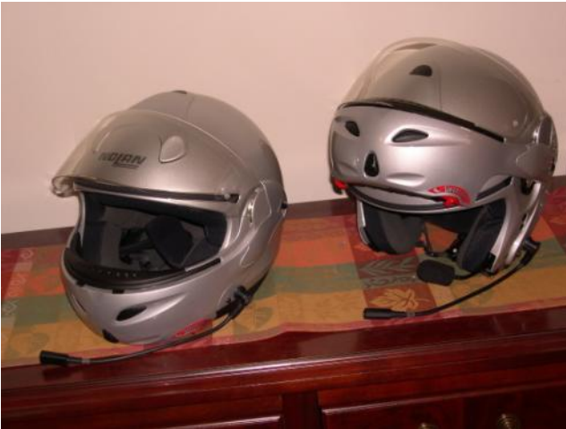
NOLAN-N100E_Sm.&Md. With Headsets