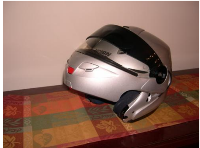
NOLAN-N102_Sm. No Headset