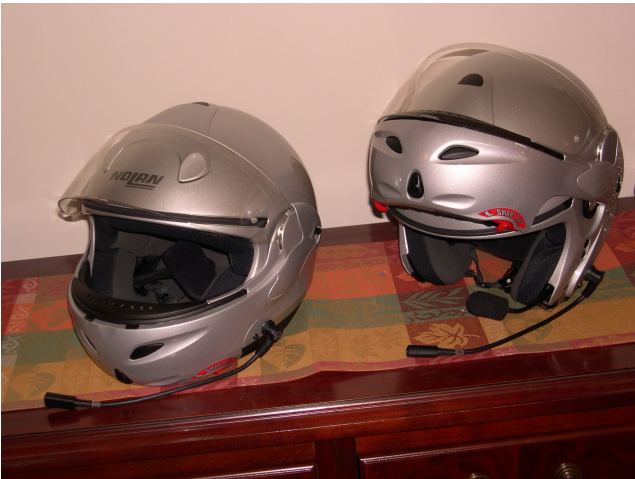
NOLAN-N100E_Sm.&Md. With Headsets