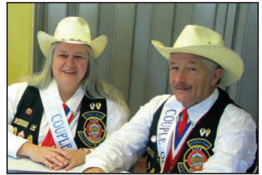
Article Taken from September 2016 Region "A" News